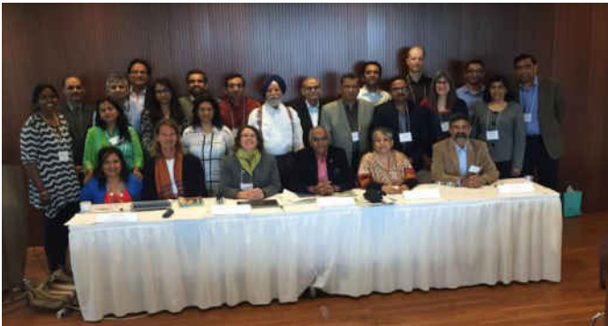
CMC members posing for a group picture during the council meeting in Canada